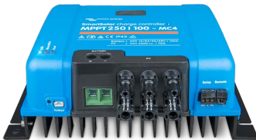
SmartSolar Charge Controller MPPT 250/100-MC4 without display