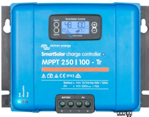
SmartSolar Charge Controller MPPT 250/100-Tr with pluggable display