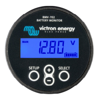
BMV 702 Black